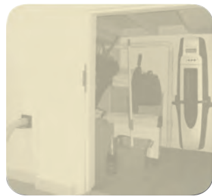
unit in under-stairs cupboard