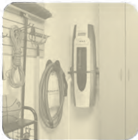
unit in garage

As the filters within the appliance are to a high standard, the exhaust doesn't always need to be vented to the outside, especially if it is located in a garage. However, if the appliance is in a utility room and it is convenient to do so, venting externally ensures even the smallest particles and vacuum smells can be eliminated.